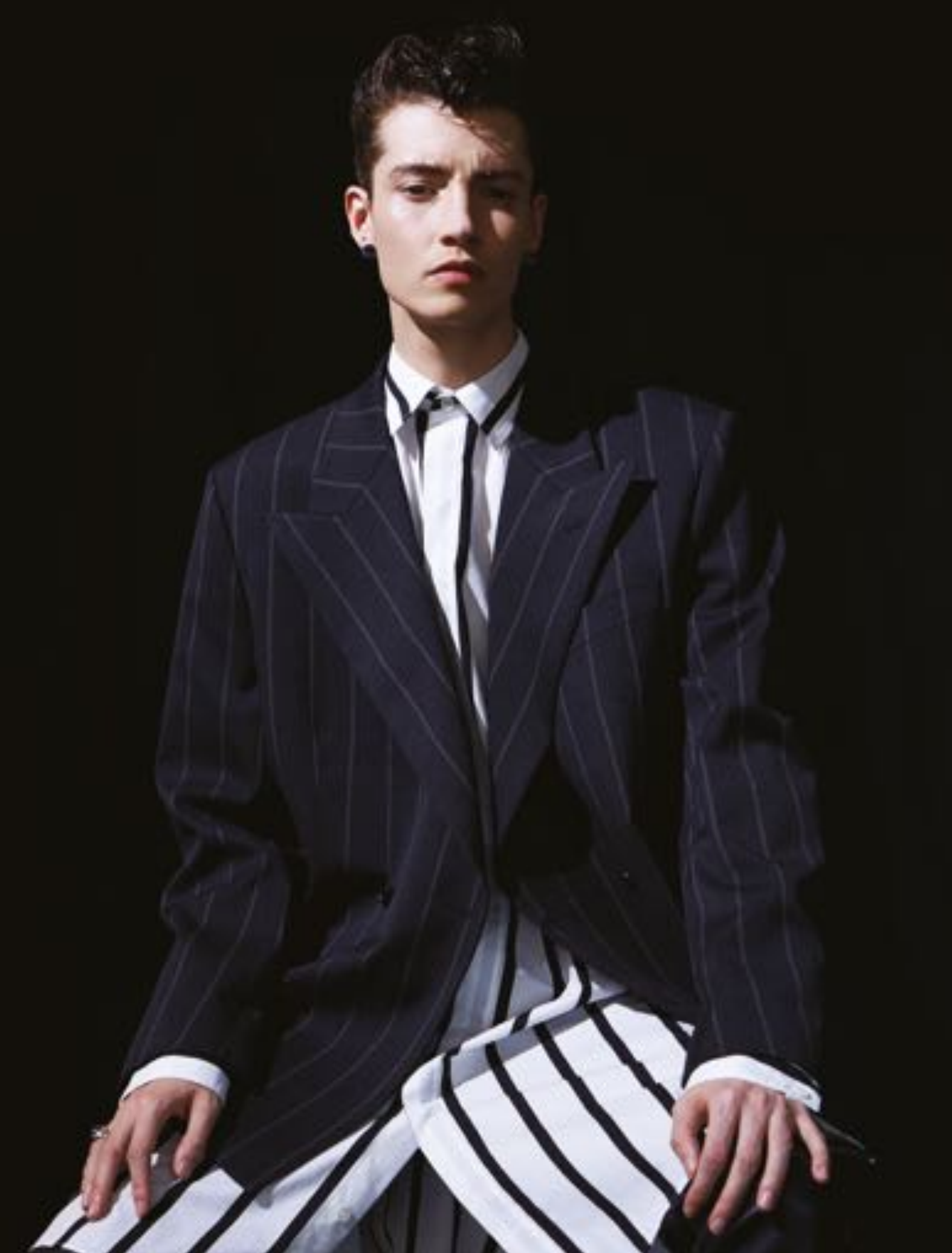
Blazer, trousers MSGM Shirt BALMAIN