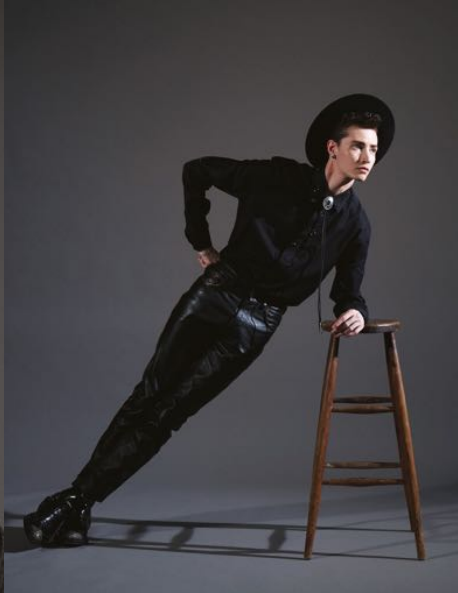
Top, trousers, hat SAINT LAURENT BY ANTHONY VACCARELLO Tie DSQUARED2 Shoes STYLIST'S OWN