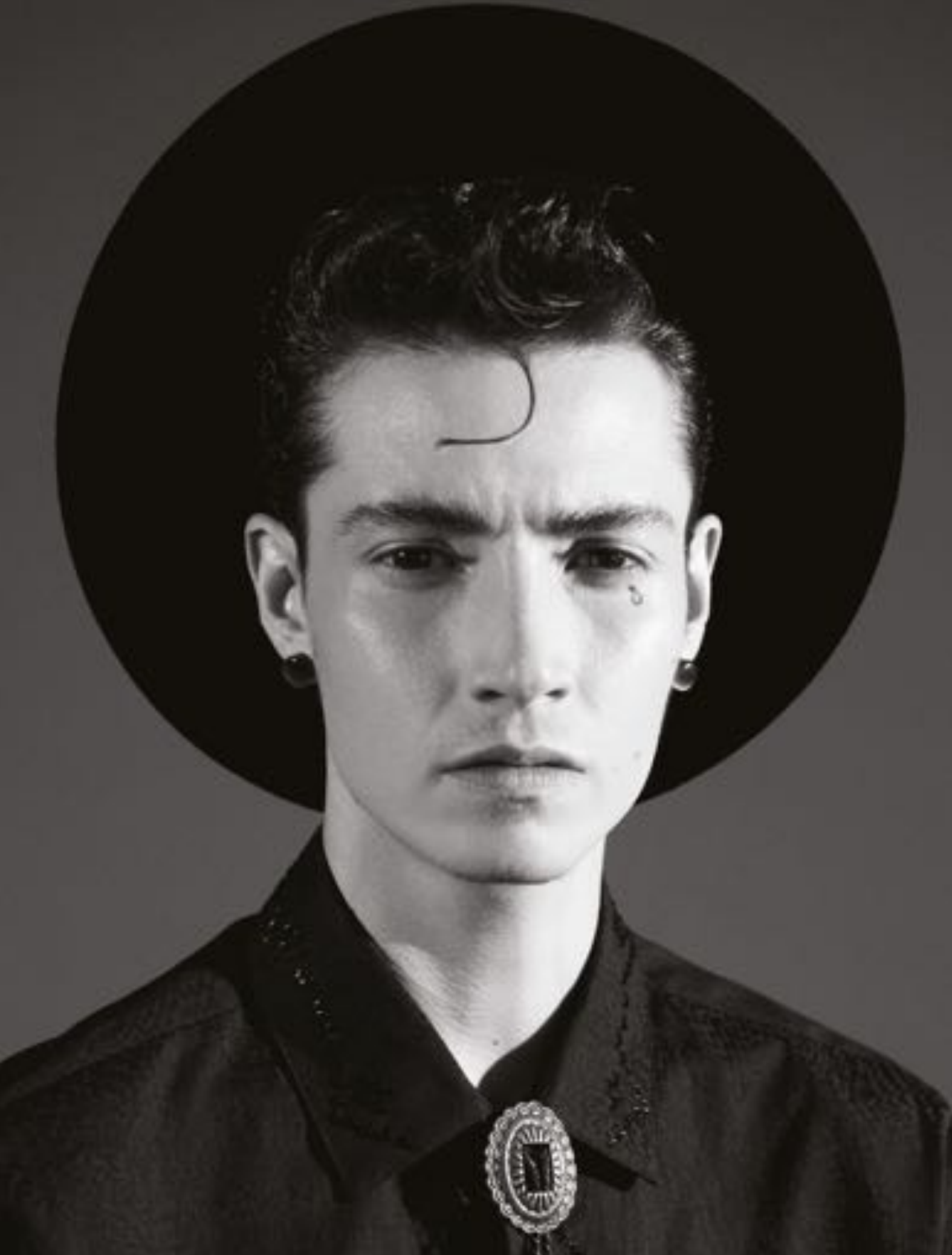
Top, hat SAINT LAURENT BY ANTHONY VACCARELLO Tie DSQUARED2