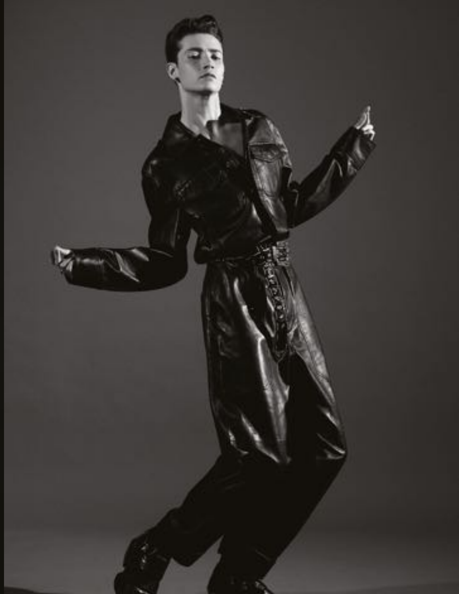
Across Jumpsuit ALEXANDER MCQUEEN Belt, shoes STYLIST'S OWN